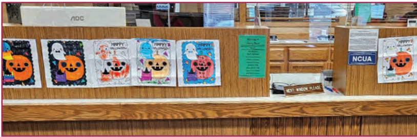
On display at the CCU Weston office is some of the artwork submitted by Lucky the Lion Kids' Club members.

Lucky Lion Kids' Club Members were invited to participate in a coloring contest with the chance to win a $25 gift card to Clay Corner Studio. One child's name from the pool of those who submitted artwork will be randomly drawn at each of the three CCU offices. Thank you to all the kids who participated. Everyone loved seeing your artwork.