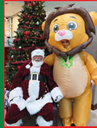
Santa and Lucky