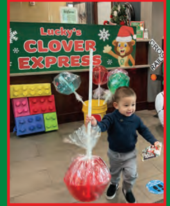
Look what Santa brought me!