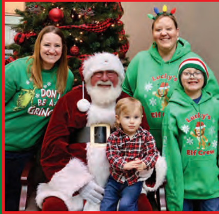
Santa with CCU family members