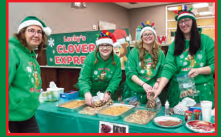
Lucky's Elf Crew

CCU's Lucky Lion invited members to join the fun and meet Santa on Saturday, December 7 at the CCU office on McIndoe Street. Kids had the opportunity for photos with Santa, and to enjoy crafts and snacks. It was a wonderful morning enjoyed by the kids, parents and staff. We look forward to making Santa's visit an annual event.